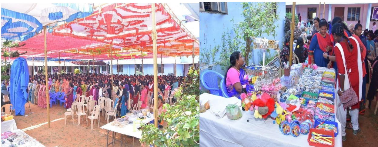
Fig 10 & 11: Students gathering at open auditorium and visiting stalls