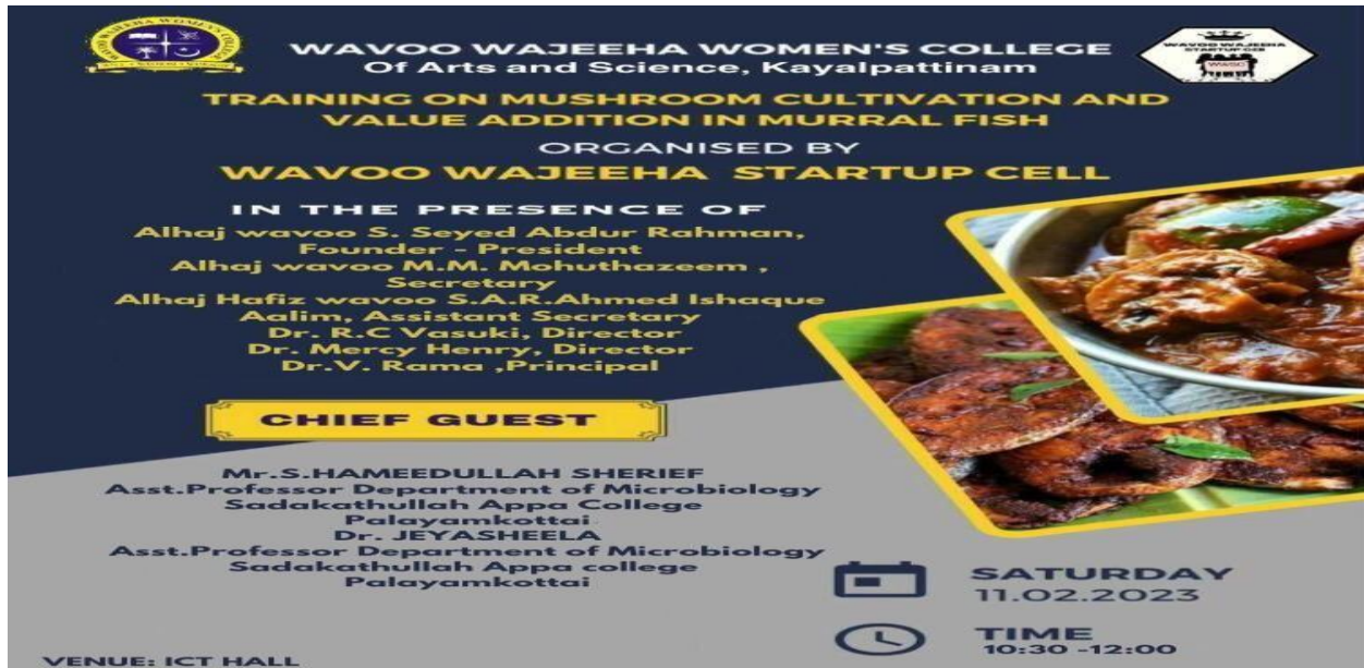
Fig 5: Flyer