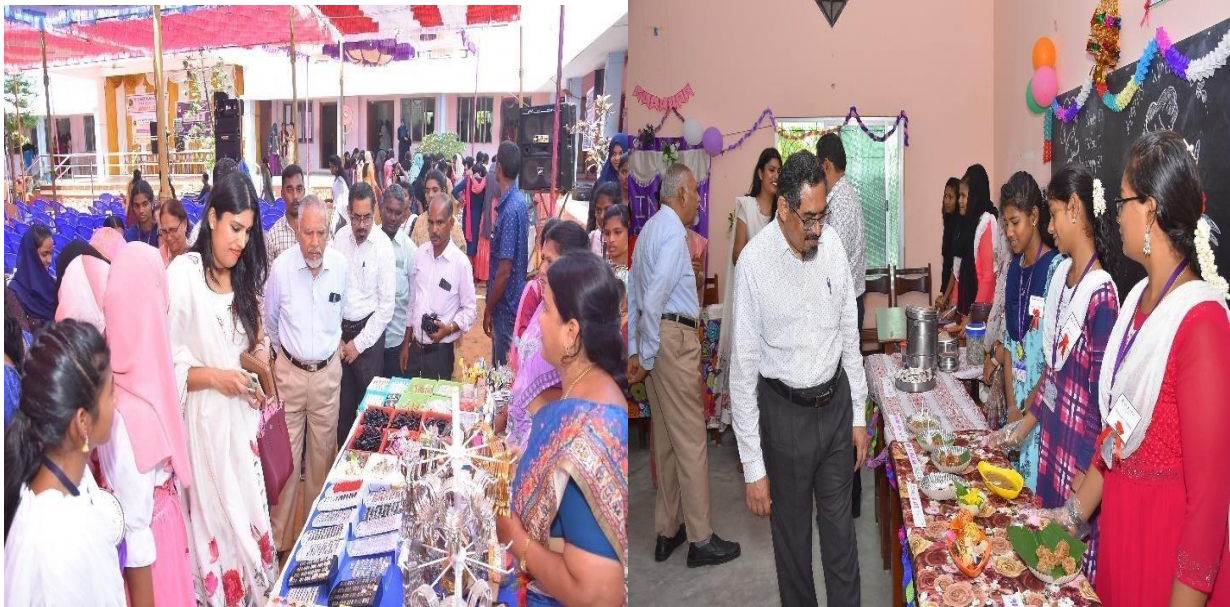
Fig 8 & 9: Founder-President Sir, Secretary Sir, Assistant Secretary Sir and Chief guest visiting the stalls displayed by SHG and Students