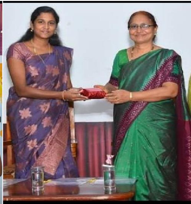
Fig 2: Principal honoring the chief guest