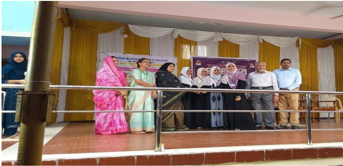
Fig 12: Chief guest along with President sir, Assistant Secretary sir, Principal Madam, ED cell coordinator honoring the winners.