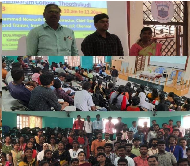
Fig17: Resource people and Participants at the venue