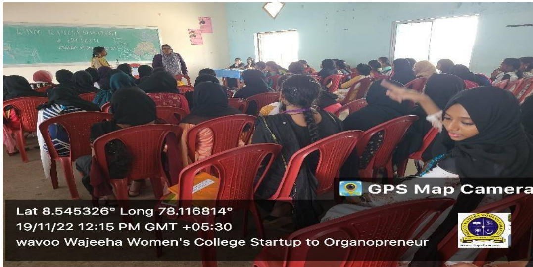
Fig 4: Chief Guest speech and students discussion